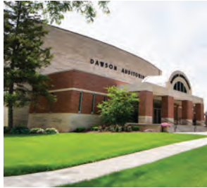
DAWSON AUDITORIUM Adrian College Campus

Visit AdrianSymphony.org for Maps and Directions.