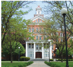
HOLY ROSARY CHAPEL Adrian Dominican Motherhouse