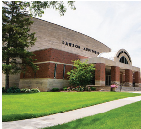
DAWSON AUDITORIUM Adrian College Campus

Visit AdrianSymphony.org for Maps and Directions.